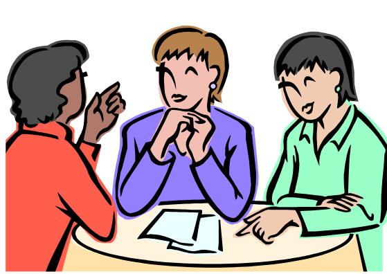
Consultant the audience your project aims to serve: