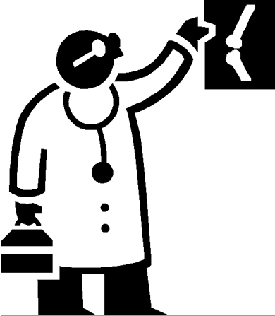
Become the local expert