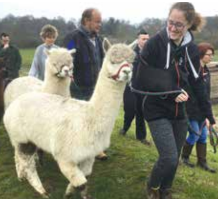
Pathways Care Farm

"We'd like to thank all the Suffolk Dog Day supporters. Your generosity is much appreciated. Suffolk Community Foundation are a great organisation that helps us find grants so we can meet the needs of our clients. We can make a huge difference to the people we help and the services we offer such as art groups for the carers of people living with dementia and the groups who meet to reduce social isolation."