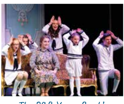
The B&B Young People's Theatre Group